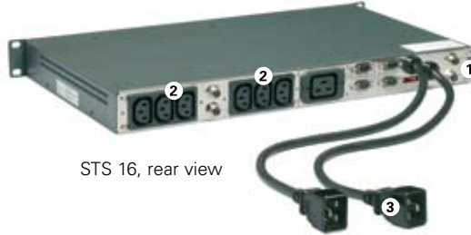
STS 16, rear view