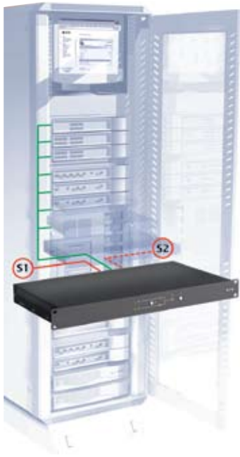
Eaton STS 16